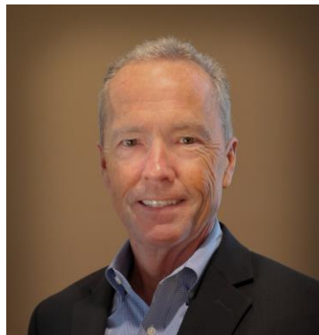
Dickey Watson Industrial Chemicals, Inc. Flowery Branch, Georgia